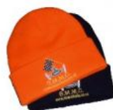
Knitted Hats 100% Acrylic - machine washable Embroidered with BMMC Logo Colours :- Black or Orange