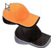
Baseball Caps 100% Brushed Cotton Twill Velcro adjuster C/w BMMC Logo Colours: Orange or Black

All regalia can be viewed and ordered on the official website: