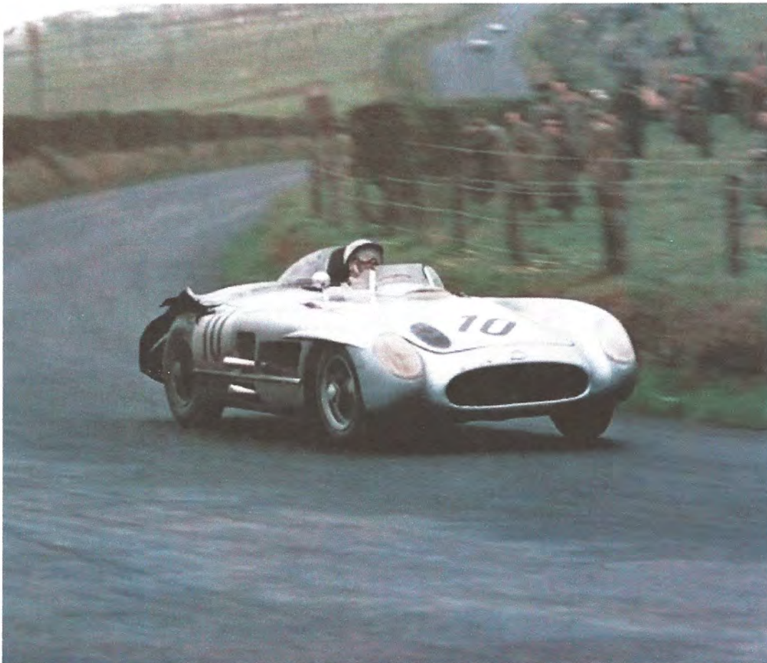
Stirling Moss damaged Merc 300 SLR wins Dundrod T.T. 1955.