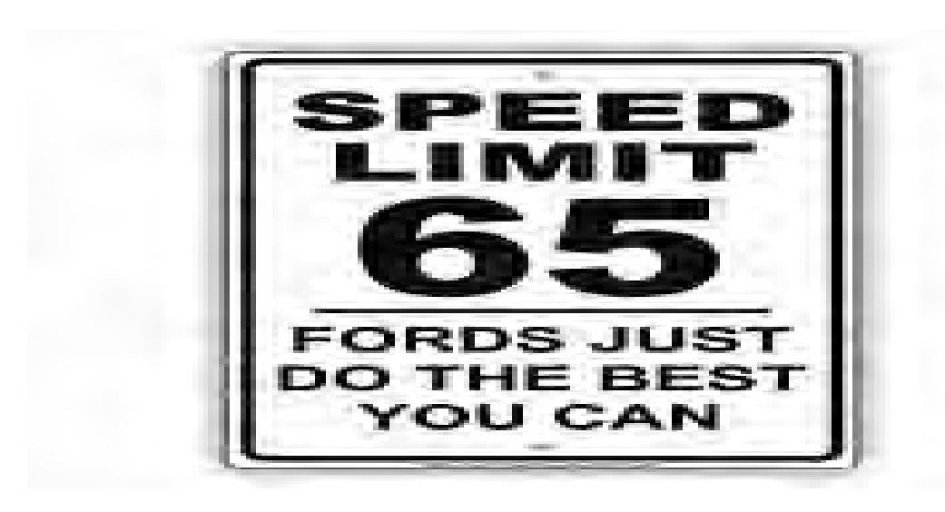
1930 road sign in America. Who say's the yank's have no sense of humour?