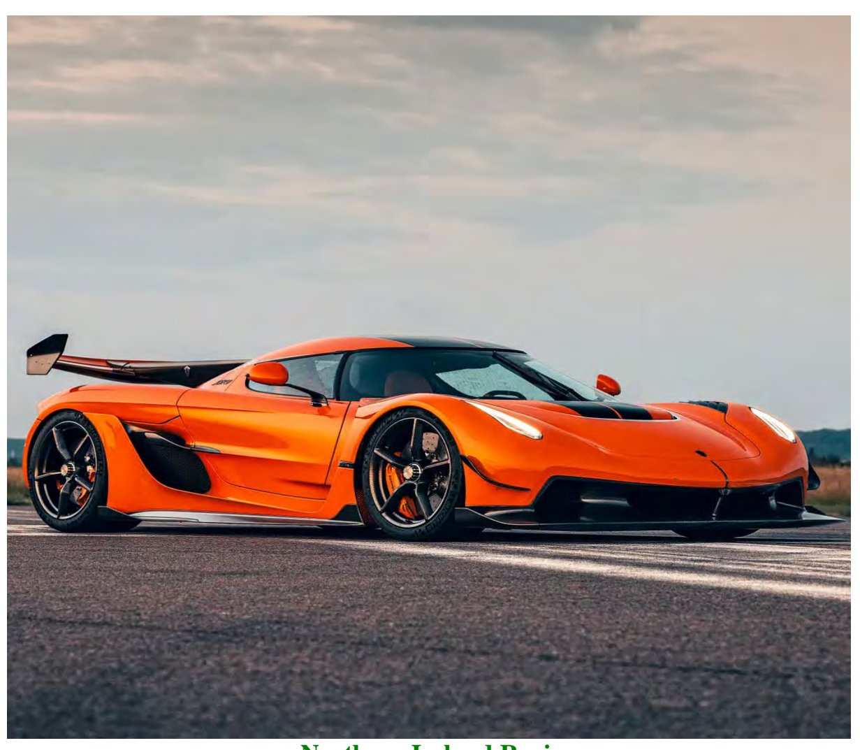
Northern Ireland Region.