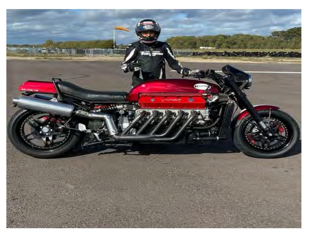
A madman in the U.S has built a Viper V10 road bike with a top speed of over 220 MPH. Hope he lives to tell the tale!