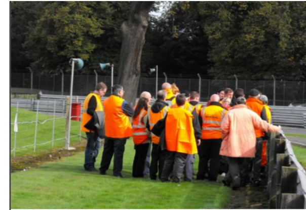
Old Hall Corner is one of the busiest for incidents and the last point track side before the group return to the paddock.