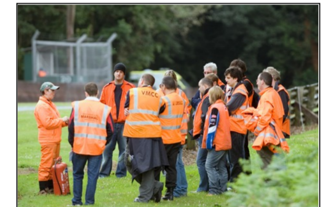
Water Tower and one of the fastest parts of the circuit with its blind approach from Clay Hill to the double apex at Druids.