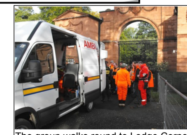
The group walks round to Lodge Corner and an explanation of the equipment and role of the Rescue Unit.