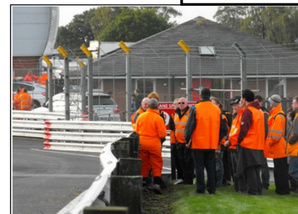
Start of the morning walkabout by the Pit Entry Lane then across the track.