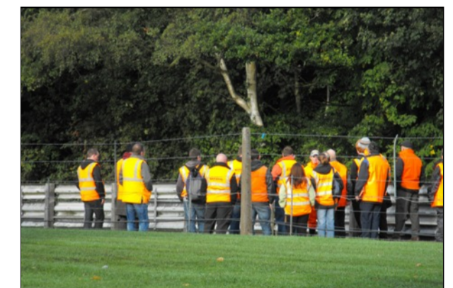
Crossing to the inside of the track they visit several posts around the circuit to see the marshals in action.