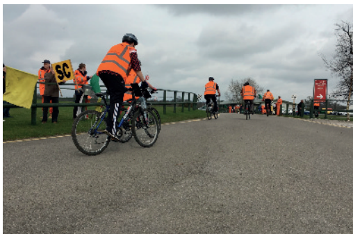
Learning to flag in a scenario based event is key to developing the best flaggies!