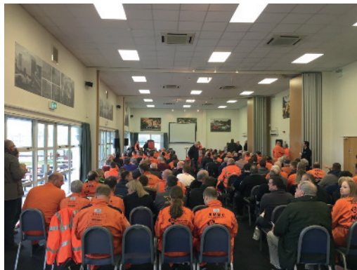
North West Region Training Weekend gets underway with another full house! Over 400 participants attended.

Renewing is easy with our on-line renewal system on the website.