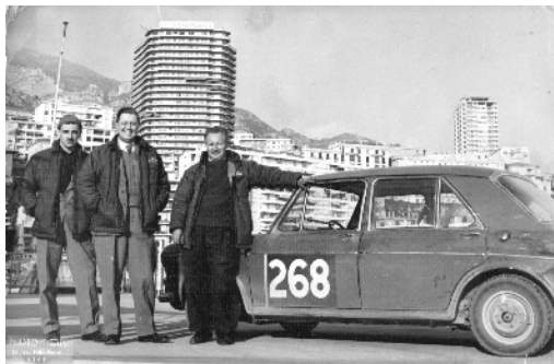
XXXIII e RALLYE AUTOMOBILE MONTE-CARLO JANVIER 1954