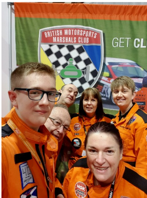
Sunday Crew for the BMMC stand at the Autosport Show International