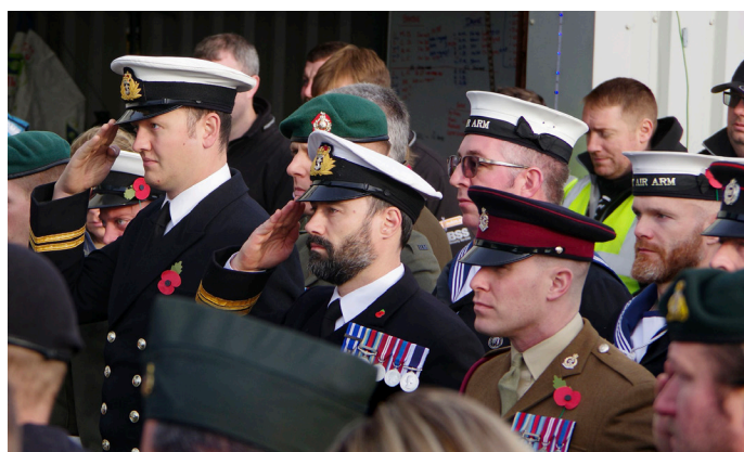
Pictured above: A perfectly observed minute's silence during the pitlane service on Remembrance Sunday.